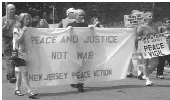
Peace Action members at Montclair July 4th Parade